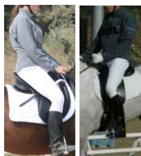
Classic dress : 8 points