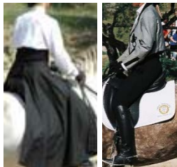
12 points PART DRESS