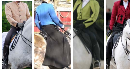
14 points with classical boots and trousers