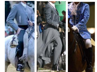
16 points FULL DRESS