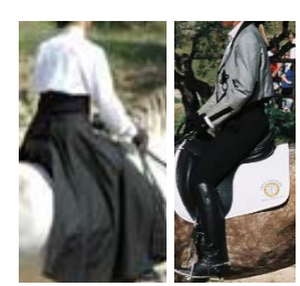
12 points PART DRESS